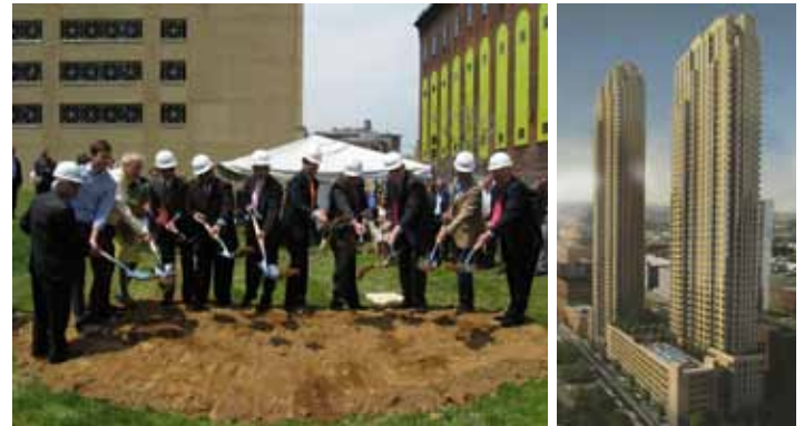
The new 50 stories Trump Tower II in Jersey City, will start in less than 30 days.